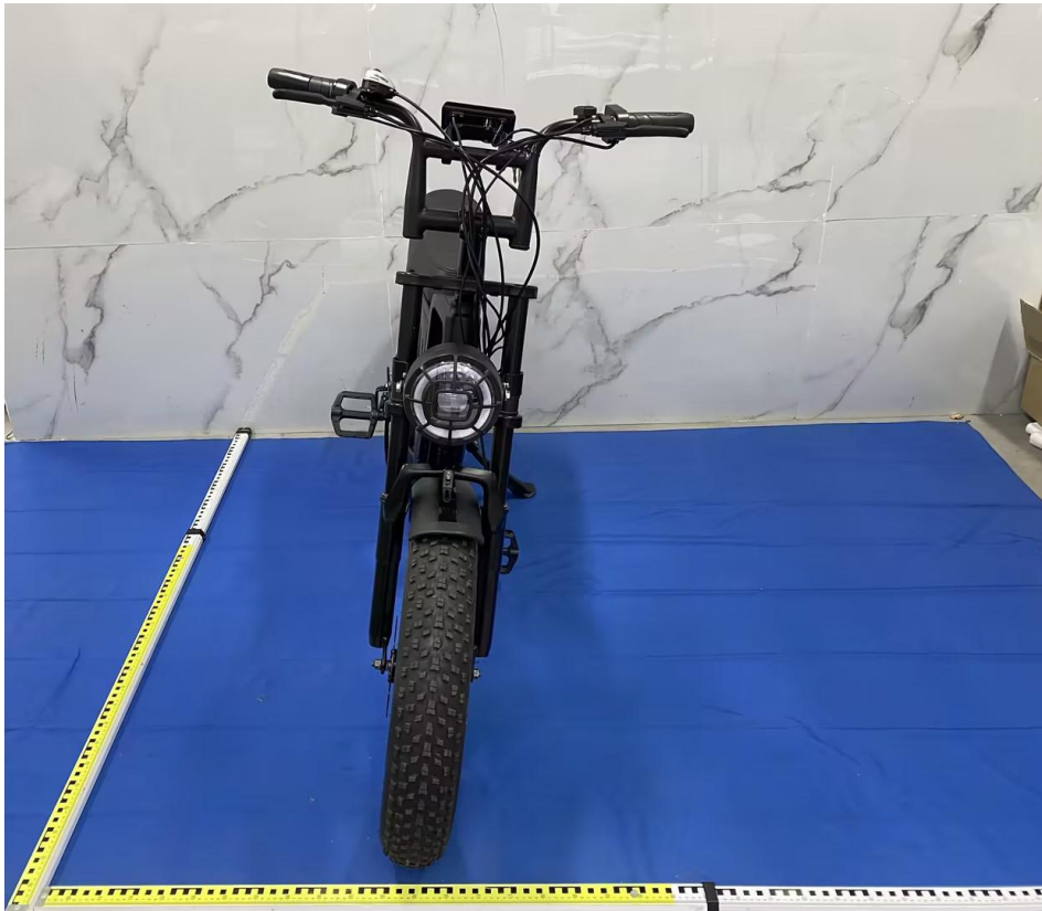
Photo 4 Overall view