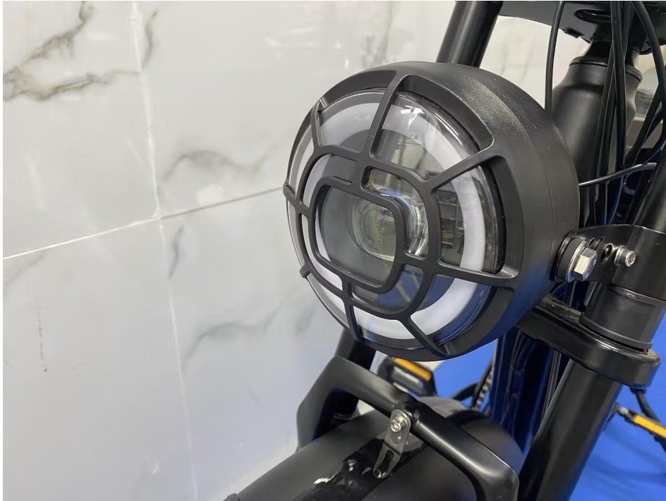
Photo 6 Overall view