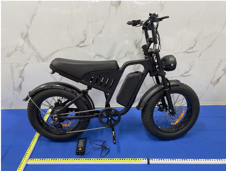
Photo 2 Overall view