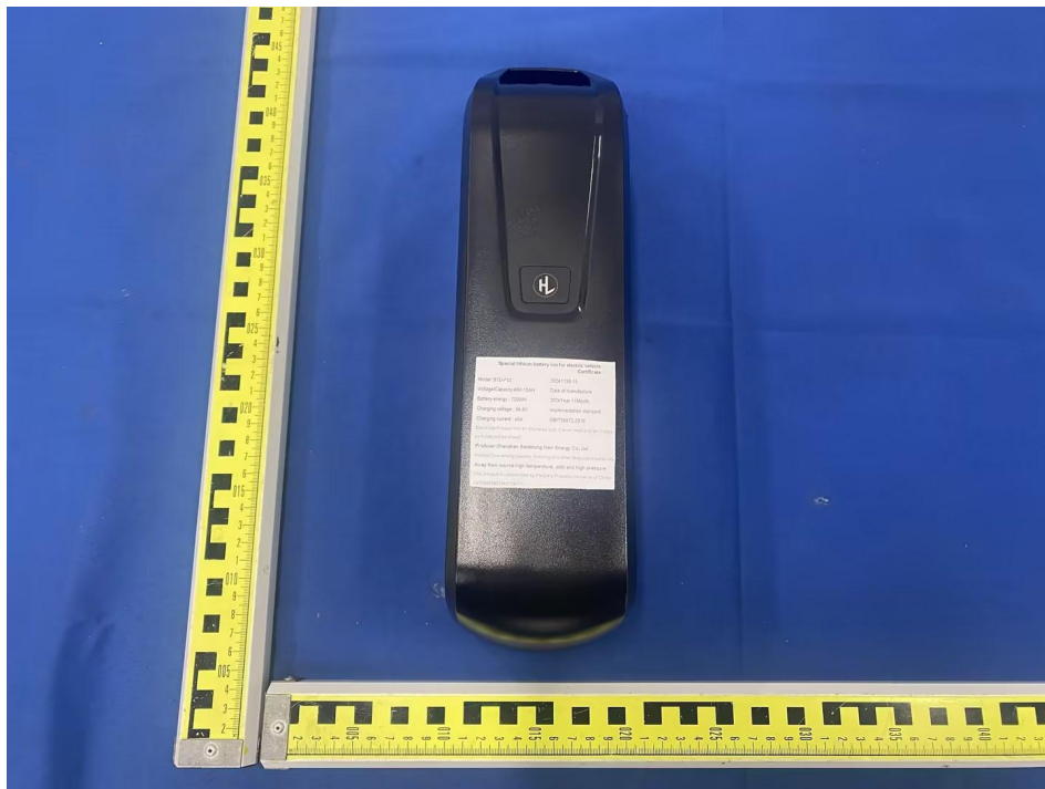
Photo 8 Adapter view